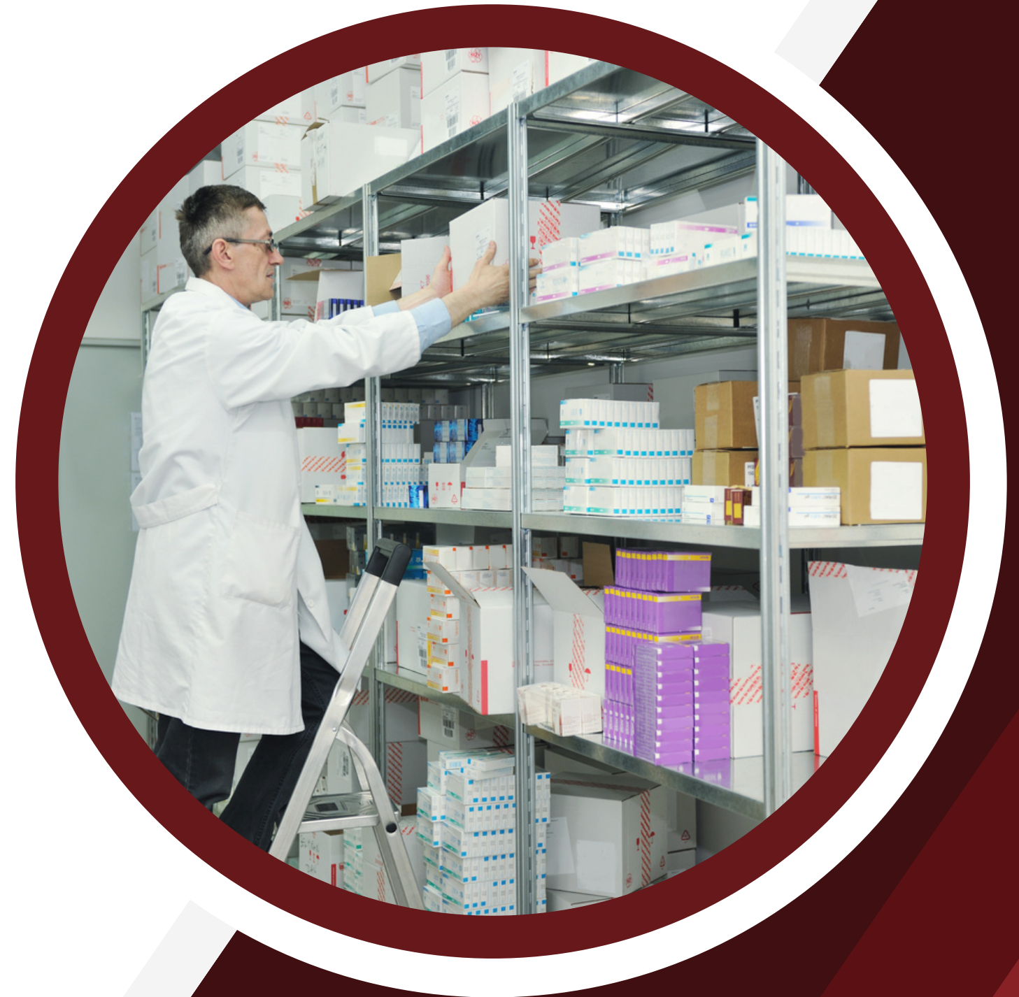
Clinical Trial Supply Chain

We understand that precision and attention to detail are paramount in the clinical trial drug supply process. Leveraging our expertise and innovative strategies, we offer a comprehensive range of services to ensure the seamless coordination and timely delivery of trial drugs. By partnering with us, our clients can conduct trials with maximum efficiency and confidence, ultimately advancing medical breakthroughs.